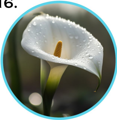
CALLA LILY .....