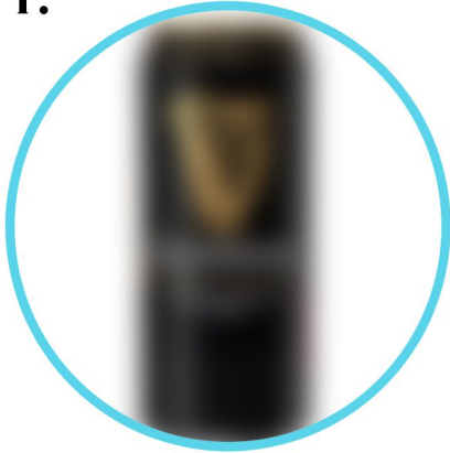
GUINNESS DRAUGHT .....