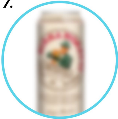
BIRRA MORETTI .....