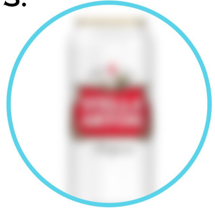
STELLA ARTOIS .....