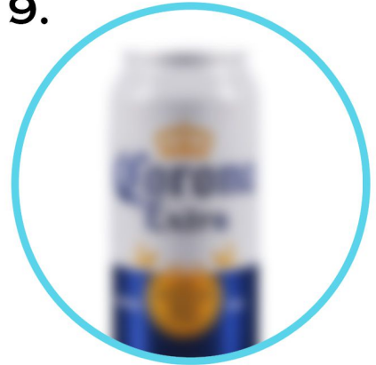
CORONA EXTRA .....