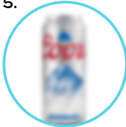
COORS LAGER .....